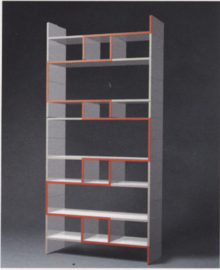
ding3000 · Sven Rudolph, Carsten Schelling + Ralf Webermann Odersoding modular shelf system